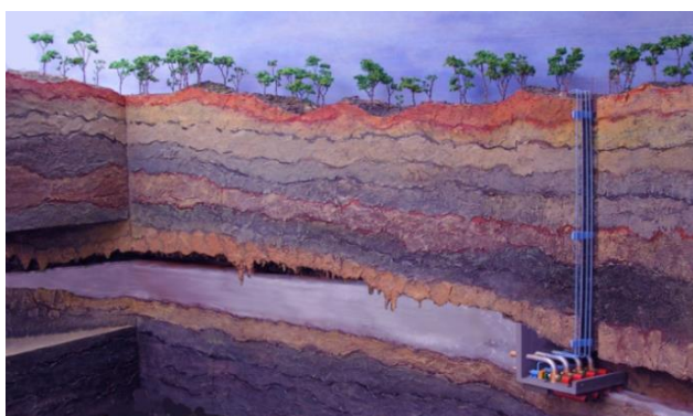
Fig. 1. Concept of Bribin's underground water supply system

Bribin's water supply system is located 100 m below the surface and can be accessed by a vertical shaft which was developed in cooperation with German tunneling experts from Herrenknecht AG. The water supply system is equipped with a hydropower drive utilizing a hydropower potential with a pressure head of 15 m by damming the underground Bribin River with a multiangular low-reinforced concrete