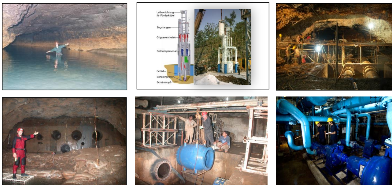
Fig. 3. Pictures impression of the implementation

With the utilization of adapted technologies (among others the PAT-technology, an innovative monitoring and alert system etc.) associated with a comprehensive knowhow transfer, the plant has been successfully and continuously operated since the year 2011 under the autonomous assignment of local Indonesian authorities. Because the operation of the plant does not require expensive external energy carriers (diesel or electrical energy) this facility can cost-efficiently be operated 24/7.