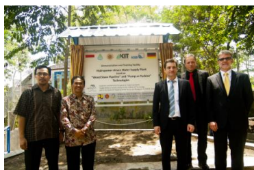
(d) Commissioning of the facility