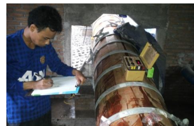
(c) Monitoring of stress distribution at clamping rings