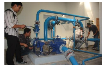
(f) Students carrying out measurements during practical courses