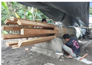
(a) Construction of wood-stave pipeline

As a demonstration facility, this plant has been utilized intensively by UGM during guest visits, workshops, conferences etc. Regarding the plant's function as teaching facility, the plant is used for mandatory practical courses of UGM bachelor and master students. Here it is possible for the students to gain practical experiences with two types of conveying modules under different operating conditions by varying the hydraulic head (at the inlet pool) or the pumping head (by implementing hydraulic resistances at the test line area). For further assessment of the plant's performance a monitoring system which measures the inflow of the PATs as well as the supply discharge and rotation speed of the feed pumps was developed. From research point of view, among others the investigation of the wood-stave pipeline's long-term behavior in a tropical environment, the application of locally manufactured pumps used as PAT or feed pump, the assessment of technology adaptation to the needs and knowhow of local users within multiplications projects etc. can be carried out.