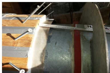
(b) Implementation of wood-steel-concrete connections