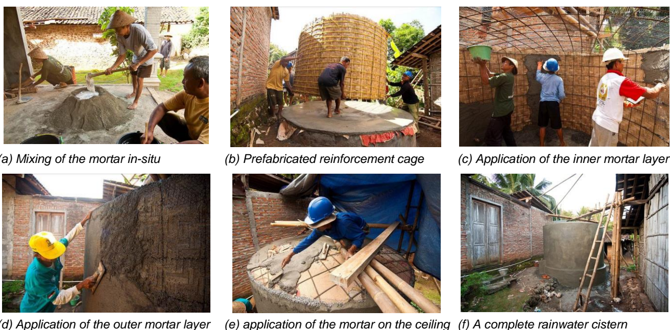
Fig. 2. Pictures impression of the implementation

The results of the optimization of mortar composition led to three main features which are (I) reduction of cost by using only locally available building materials, (II) cement reduction by lower w/c-ratio leads to higher durability and (III) better workability by use of saccharose. The methodology of how to compose the mortar composition according to its intended range of application was summarized in a comprehensible practical guideline. It was translated into English – Indonesian language and handed over to the villagers as an important part of the capacity development measures. The basic concept was already discussed in detail and field-tested with the local persons during the joint construction of a complete new cistern in September 2012. The experiences gained in-situ were used to further adapt the concept to the local situation. The revised concept including the finally developed material composition was successfully implemented with the joint construction of two further cisterns in May 2013 and September 2014.